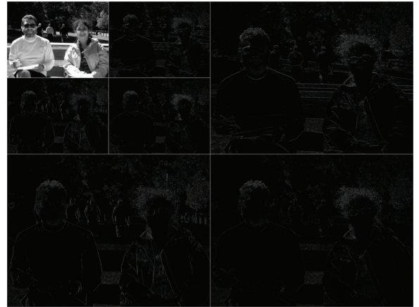
Figure 1: A two-level wavelet decomposition

When we perform the two-dimensional version of this analysis on an image, the result is four new images: Three edge-detected subbands , plus the smoothed image. In these experiments, we do four levels of decomposition, and so 13 images are generated during the composition. A two-level wavelet decomposition of an image is shown in Figure 1.